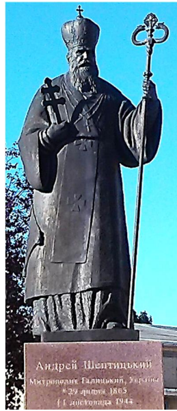
Sculpture of Metropolitan Andrey in Philadelphia near Ukr. Cath. Cathedral