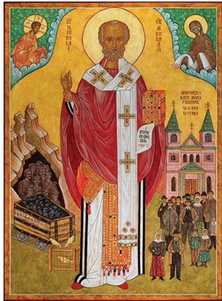
The icon “St. Nicholas Day Pass Over 1907,” which was presented at Holy Trinity Ukrainian Catholic Church in Carnegie, Pa.