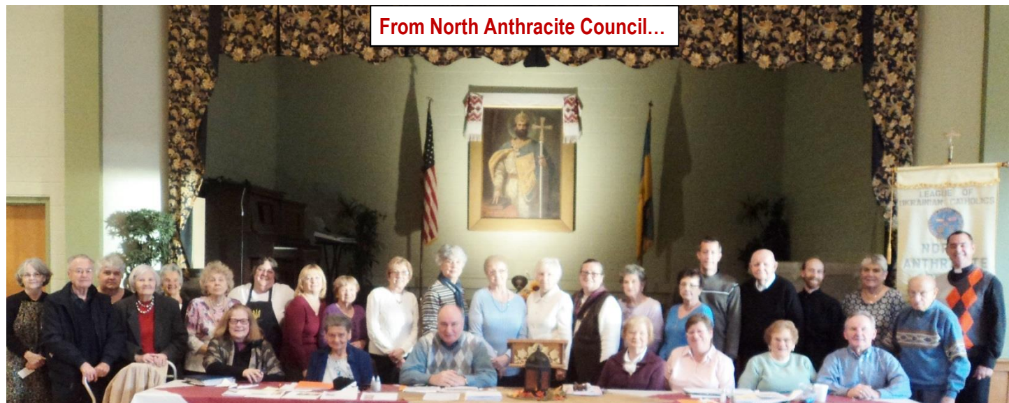
From North Anthracite Council...