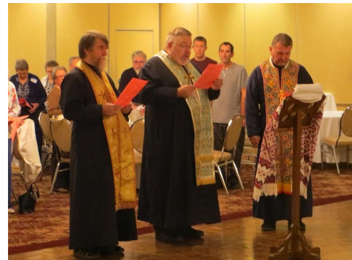
Panachyda Service for the deceased members of LUC