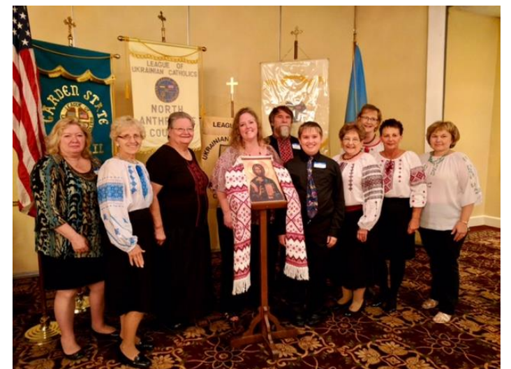
Contingent from Niagara Frontier Council